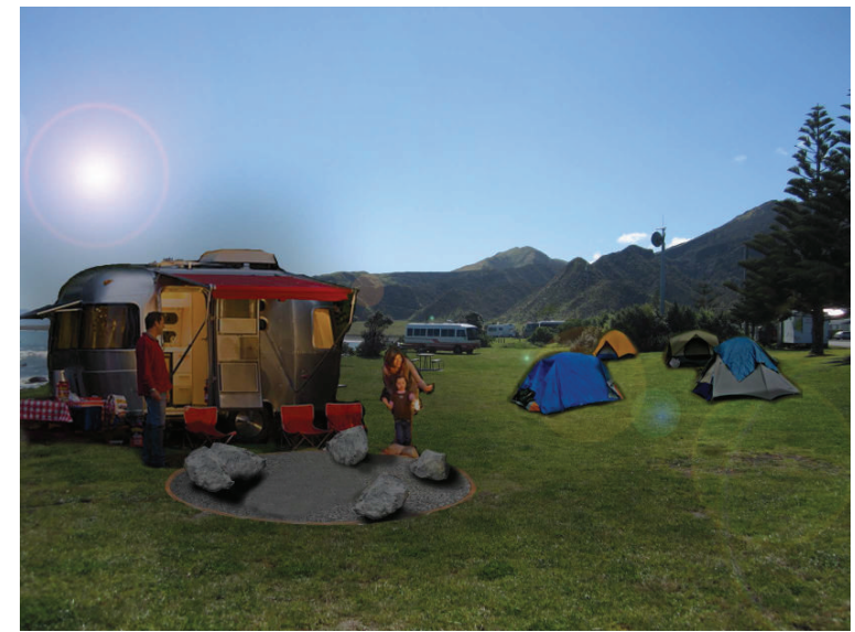
PICTORIAL D PICNIC AREA AND CAMPING